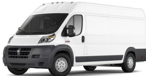
Ram Pro-Master 2500